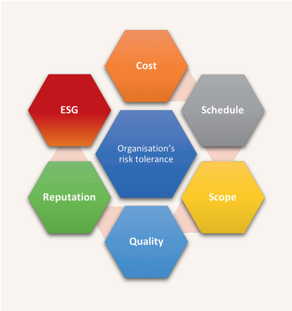
FIGURE 4 Risk tolerance of an organisation.

Risk management Risk can occur at any phase of the reservoir dredging life cycle. A “risk” is an uncertain event, activity or a set of circumstances that, should it occur, has a positive or negative impact on at least one of the reservoir dredging project objectives, i.e. scope, schedule, cost and quality. There can be multiple impacts and one or more stakeholders can be affected. The various phases of the reservoir dredging life cycle are: 1) pre-tendering; 2) tendering; 3) mobilisation; 4) execution; and 5) site restoration and demobilisation. The risk categories that can occur during reservoir dredging life cycle phases are: 1) technical; 2) economic; 3) commercial; 4) organisational; 5) political; and 6) social (nearby residents). Environmental risks will be generated by dredging activities. An Environmental Impact Assessment (EIA) should be performed prior to any dredging activities to provide sufficient knowledge about the associated ecosystems and flora and fauna thriving in the reservoir and surrounding areas. Risk management for reservoir dredging is a continuous process performed throughout the various phases of the reservoir dredging life cycle. For each phase, the steps shown in Figure 3 should be applied to reduce the likelihood of an identified risk occurring and/or to reduce the potential impact of the risk on the reservoir dredging project.