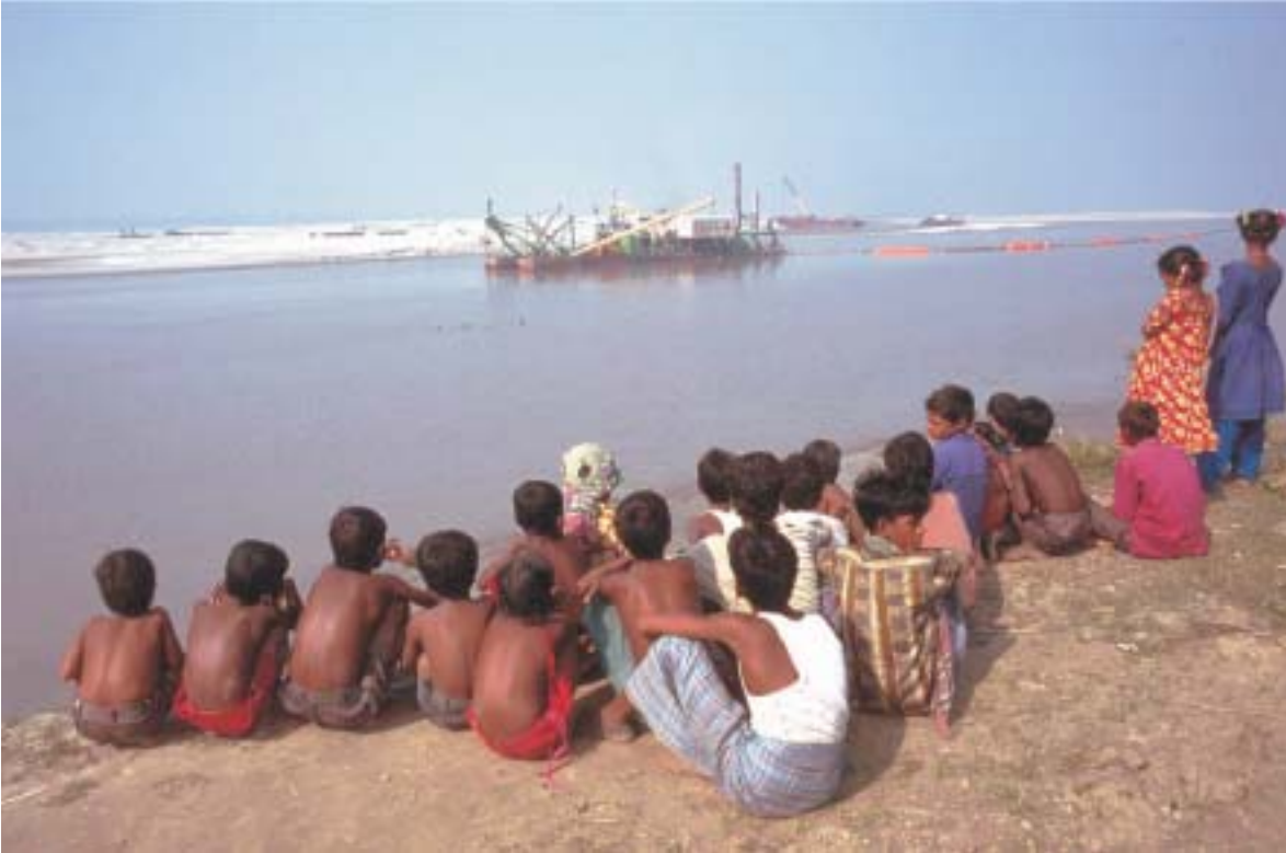
Figure 2. At the request of the Bengali Government dredging of the Gorai took place; interested citizens line the river banks to watch the works.

large amount of sedimentary sand was blocking the stream of water into the Gorai. A new low-water channel was dredged at this fork in the river with help from two cutter suction dredgers, the Gemini and the Wombat .