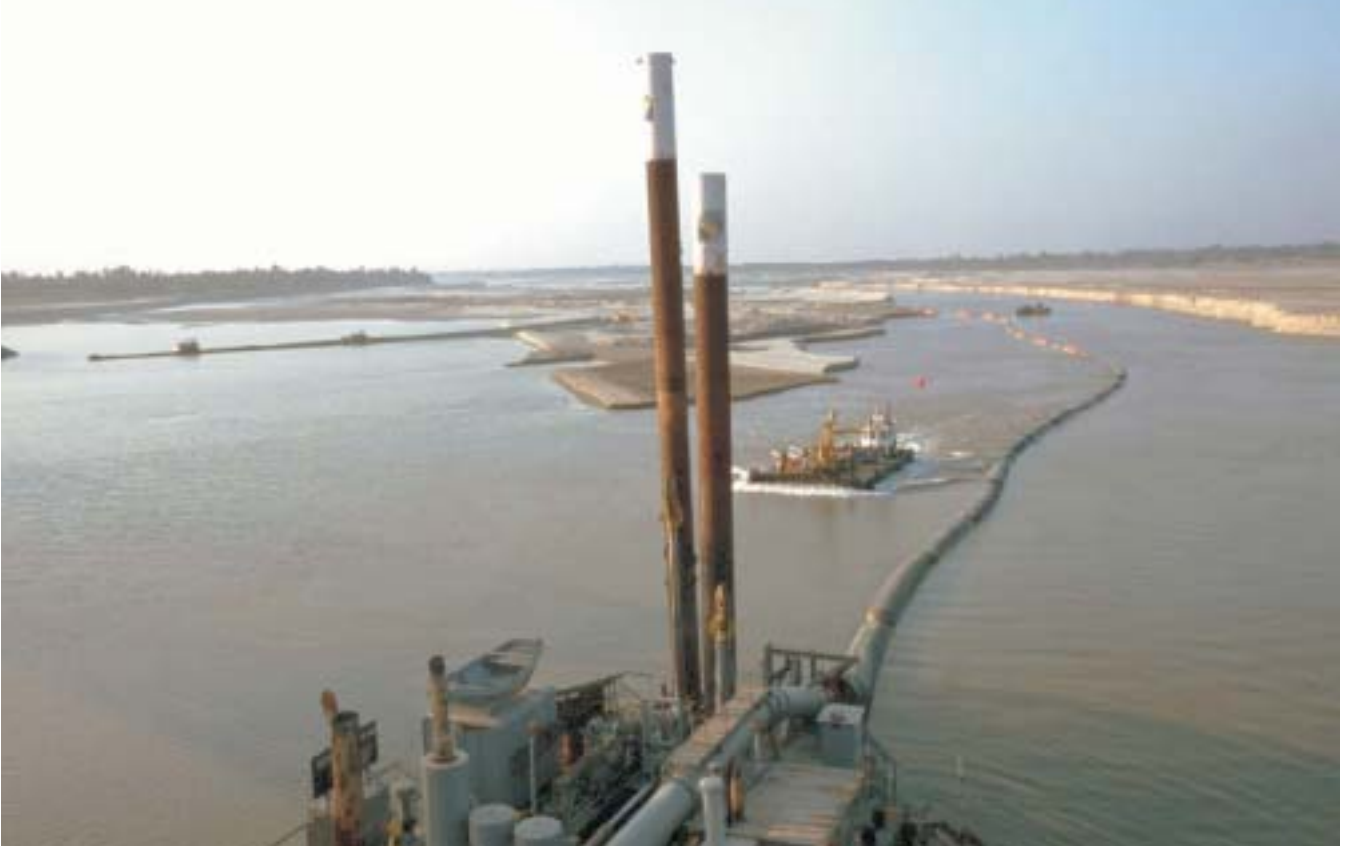
Figure 4. Aerial view of the cutter suction dredger at work.