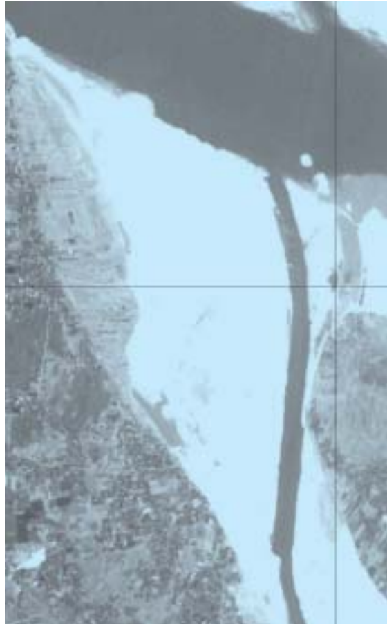
Figure 3. Bifurcation area of the Ganges and Gorai.

The second dredging season started in September 1999, just after the monsoon was finished. This time only one cutter was used. With less effort than the first time, the low-water discharge of the Gorai was restored for a second time. This provided evidence that by dredging the river, the conditions of the river stream could be restored and that a general improvement in