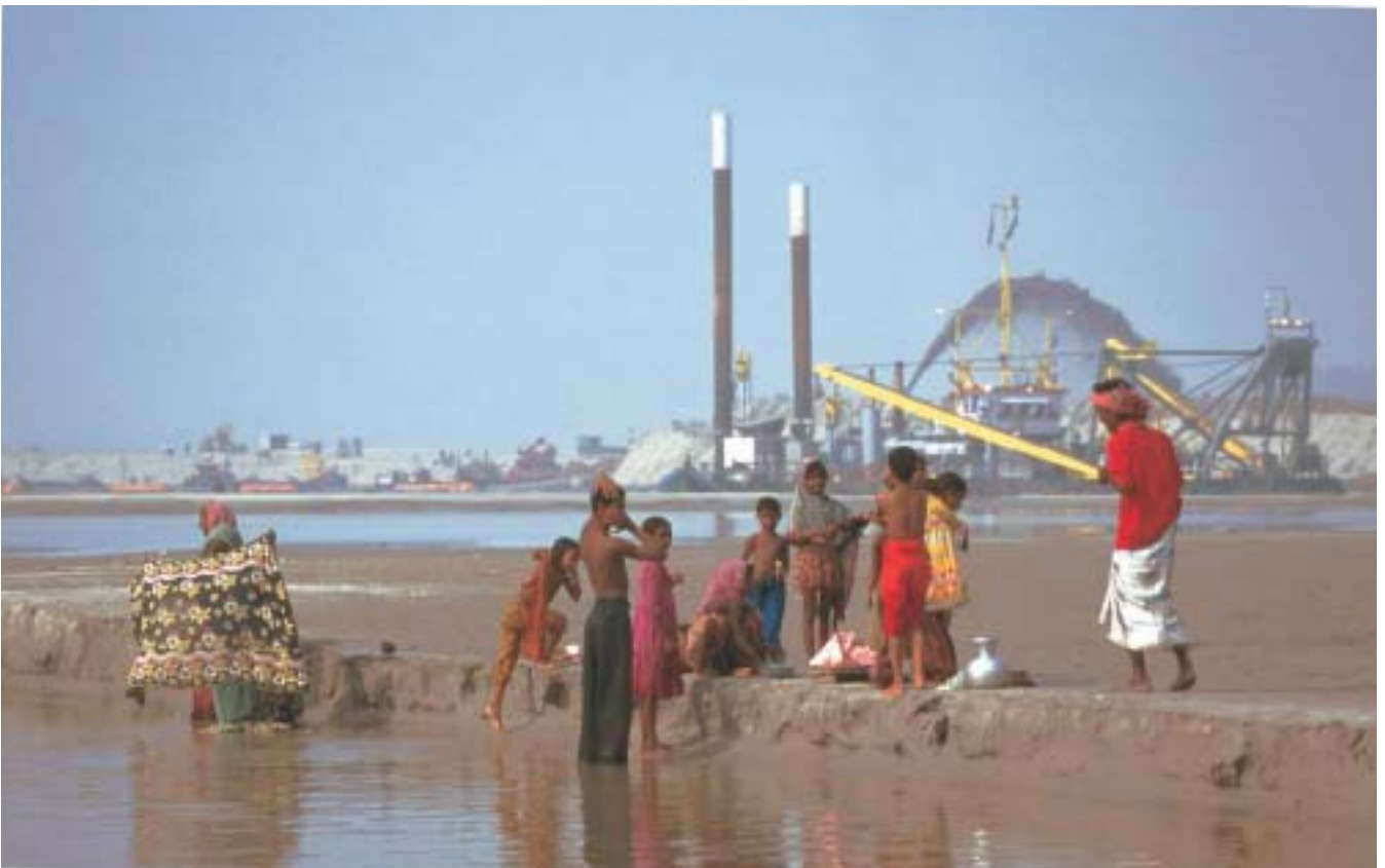
Figure 5. The Gorai provides water for washing for the populations along its banks. In the background, the dredgers continue their work.