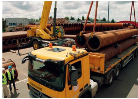
Figure 9. In the new procedure, pipes are lifted by C-hooks which are attached to soft slings.

The system is used universally across JDN's operations for consistency. Easy to use, the system begins with workers setting the bottom section atop an anti-skid rubber mat on the flatbed (see Figure 7). The bottom section receives the first layer of pipes which are then clamped into place. Workers put the mid-section cradle (see Figure 8) on top of the first layer of pipes – which is also clamped into place – to receive the next and final layer of pipes which are again clamped with the mid-section.