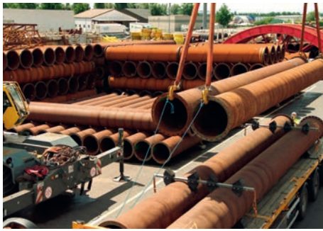
Figure 8. Made of low-density polyethylene (LDPE), Dhatec's System88 cradles stack and hold pipes in a two-by-two configuration.

which were positioned along the perimeter edges of the flatbed. While the vertical poles would effortlessly support the lower pipe layer, once the second pipe layer was set into place, the pipe's combined weight would visibly bend the poles outwards. Not to mention, workers needed to climb on top of the first pipe layer to again timber for the second layer of pipes. After searching for a much-needed alternative, Tronckoe stumbled across an existing product on Dhatec's website, the System88 cradles (see Figure 8). He knew he had found something that could replace timbering and self-standing poles in JDN's operations.