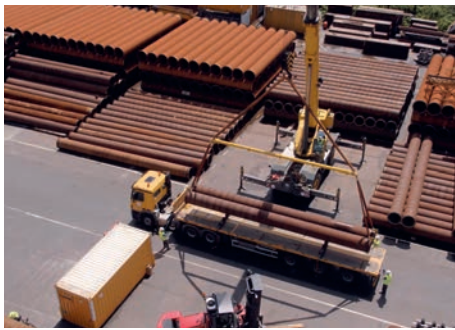
Figure 2. The team chose to proactively eliminate the potential risks to safety by replacing accepted norms within the loading process with certified alternatives.

The team’s upgrades to the lifting, stacking and securing of pipes ensures accountability that the logistics task is executed safely, a benefit to both employees and the public. In addition to increasing safety in regards to shipyard storage, crane lifting and flatbed truck securing practices, the solution heavily considers the ergonomics of the process for workers partaking in the process which takes place around the clock, all day long.