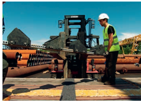
Figure 3. To begin loading pipes onto the truck’s flatbed, bottom section cradles are placed atop an anti-skid mat.

Prior to Tronckoe, Van Den Berghe and Verpoest’s innovation, the long-standing process for the transport of pipelines involved the use of metal chains which were susceptible to tangling, pipe hooks which needed to be manually positioned in and sometimes hammered out of the bolt holes in a pipe’s flanges, and wooden beams which needed to be placed by hand beneath a pipe before the pipe could be finally lowered into position and released. To stack a second layer of pipes, workers needed to climb onto the