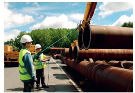
Figure 7. With a guideline in hand, riggers manoeuvre pipes into position. To hook off, riggers simply pull on the guideline after the pipe is in place.