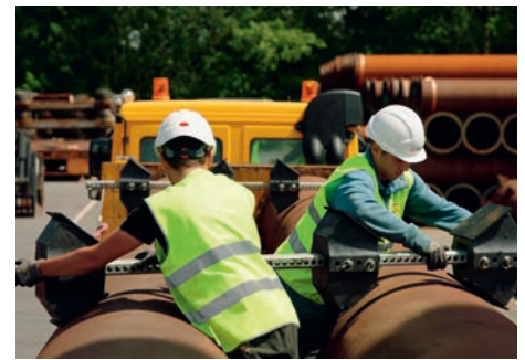
Figure 4. Workers place a mid-section cradle atop the first layer of pipes which will support the second tier of pipes.

In addition to his own concerns, he explains: ‘In Europe, securing heavy loads on trucks in a safe manner is a top priority. Our trucks are frequently inspected because there is a lot of weight on the truck, it is an eye catcher.’ So when a truck would be randomly stopped for an inspection, drivers must prove the load is secure from top to bottom. But how safe is a wedge nailed it to the floor of the truck? And how much force can a wooden wedge with a nail driven through it actually take? The rules and regulations for securing trucks are made for standard pieces of cargo such as wooden