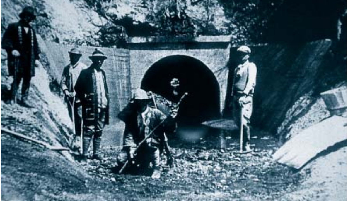
Figure 1. Men at one of the tunnels of the irrigation canal, leading from the lake of Inawashiro to the dry Asaka plain, near Koriyama. The successful digging of this canal with its many tunnels proved to be an example for the Lake Biwa Canal.

ready for serious action ever since Commodore Perry had arrived in 1853. The Westerners wanted to have access to Japan for commercial reasons and so, willing or not, Japan had to participate in the world economy.