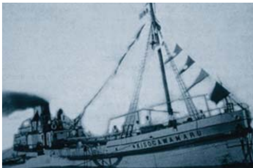
Figure 2. The suction dredger Kisogawa Maru , built in the Netherlands for Johannis de Rijke.

This was equally true in the late 19th century when Western European hydraulic engineers came to Japan and deepened and constructed harbours. Though they worked in an unpretentious way on the riverbanks, they had an enormous impact. During the presence of the oyatoi gaikokujin , hired foreign employees, the Japanese government established the Imperial University in Tokyo, and the British set up an Engineering College in the same city. It was Brunton again who emphasised the importance of practical training for students. No theory, but direct action. It was he who championed the brick stone as an answer to the many fires by which the wooden houses and other construc-